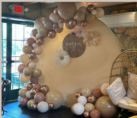
7' ROUND BACKDROP WI COVER $50