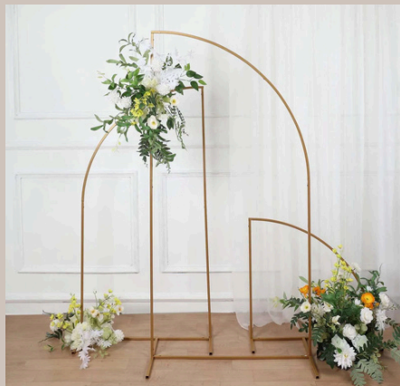
7' 1/2 ARCH BACKDROP WI COVER $40