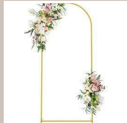
6' ARCH BACKDROP WI COVER $40