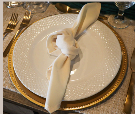
CHARGER PLATES FAUX WOOD OR GOLD $1 EACH