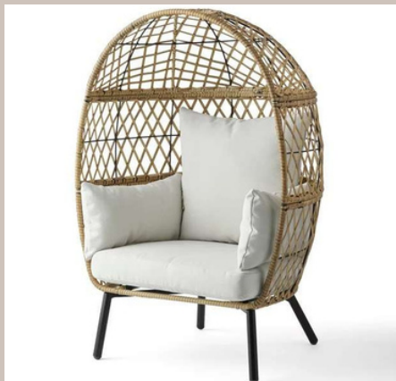
WOVEN EGG CHAIR $75