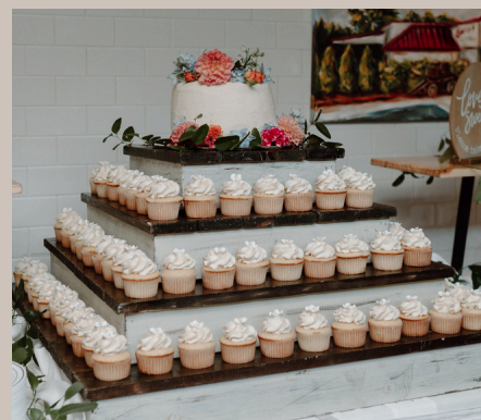
TIERED CUPCAKE STAND $25