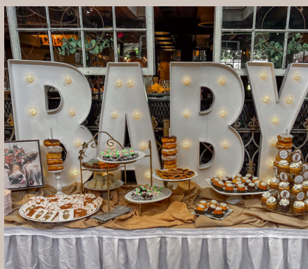
B.A.B.Y LETTERS $50