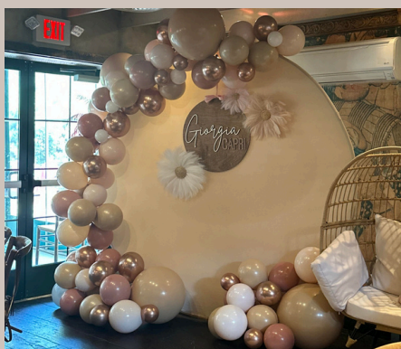
7' ROUND BACKDROP WI COVER $50