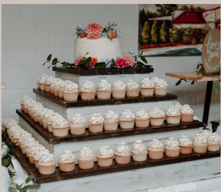
TIERED CUPCAKE STAND $25