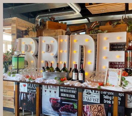
B.R.I.D.E LETTERS $50