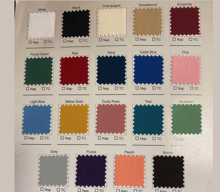
AVAILABLE LINEN COLORS INQUIRE FOR PRICING