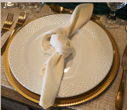
CHARGER PLATES FAUX WOOD OR GOLD $1 EACH